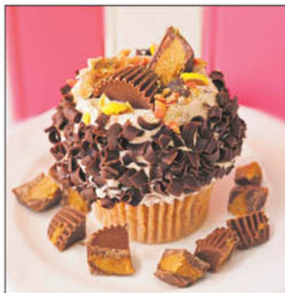
The Peanut Butter Pizzazz cupcake is one of the shop's top sellers.

"Our goal is to always expand to make (Casey's Cupcakes) as big as possible," Reinhardt said.